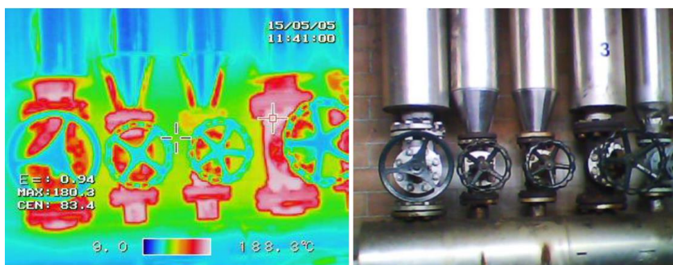
Figure 2: Infrared assessment of thermal insulation level.

With specific reference to the best practice on insulation of equipment and tanks, Errore. L'origine riferimento non è stata trovata. provides an example of on-site assessment by infrared camera to identify potential areas where insulation needs to be improved.