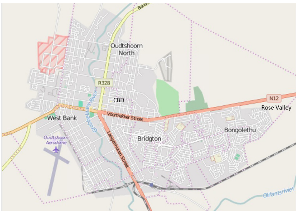
Figure 2: The spatial layout of Oudtshoorn town