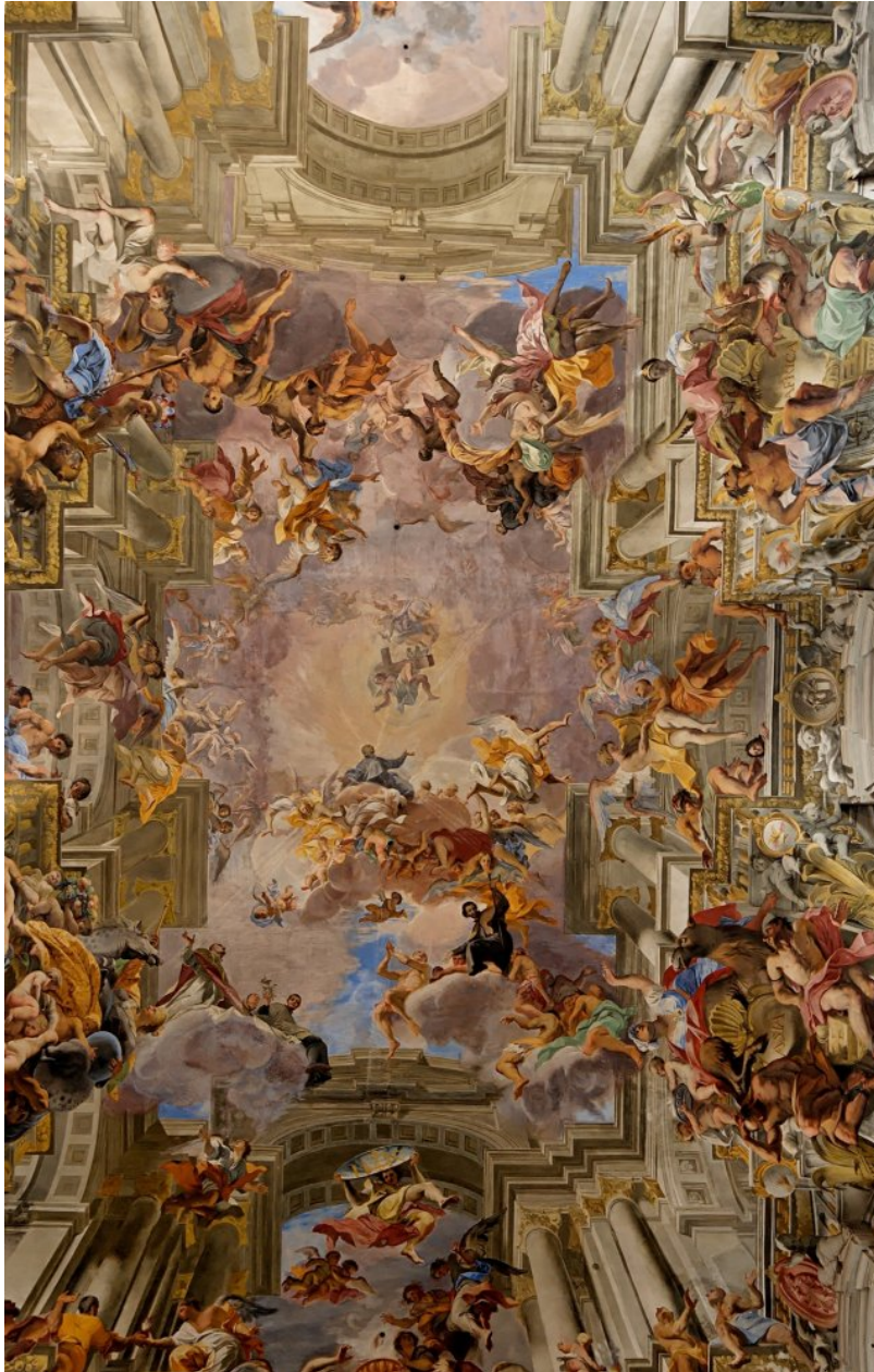
Figure 2. Andrea Pozzo, Apotheosis of St. Ignatius , (1691-1694).

Over the years, the tools available to art in all its forms have become incredibly more sophisticated, and these same tools can be used by those who valorize art and cultural heritage as an economic and social strategy. The protection of our heritage has to be supported by communication, which comes to play a decisive role in the awareness of the layman. The language of art has changed; now the