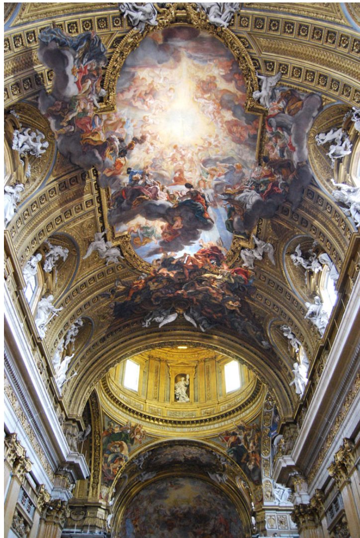
Figure 1. Giovan Battista Gaulli, The Triumph of the Name of Jesus , (1672-1675).

This writer will never forget the incredible effect of the video Homo Sapiens Sapiens projected onto the vault of San Stae at the 2005 Venice Biennale. The video flickered and canceled the Baroque architectural space: a dreamlike show that the public could view while reclining on armchairs. The total involvement of this show reminded us of the works of the great Baroque artists the Church commissioned to represent epiphanies celebrating the Christian dogmas in response to Protestantism. Magnificent frescoes then reduced the space, creating amazing "trompe l'oeil," "horror vacui," and scenography to serve the glory of the Church that was losing its power to persuade and was forced to use as expedients the incredible projects of famous masters of illusion: examples are the Triumph of the Name of Jesus (Fig. 1) on the vault of Gesù church in Rome painted by "Baciccio," Giovan Battista Gaulli (1639-1709), or the Apotheosis of St. Ignatius (Fig. 2) by Andrea Pozzo (1642-1709) in another Roman church, Sant'Ignazio di Loyola.