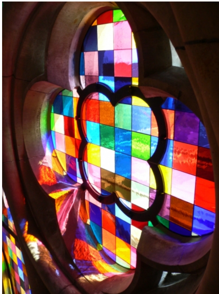
Figure 5. Stained glass window of the Cologne Cathedral, 2007.