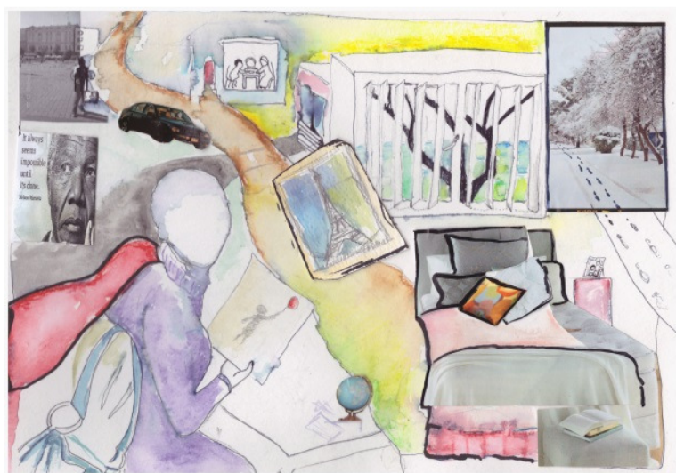
Figure 3: Celine , 2014, drawing and collage, Marguerite Müller