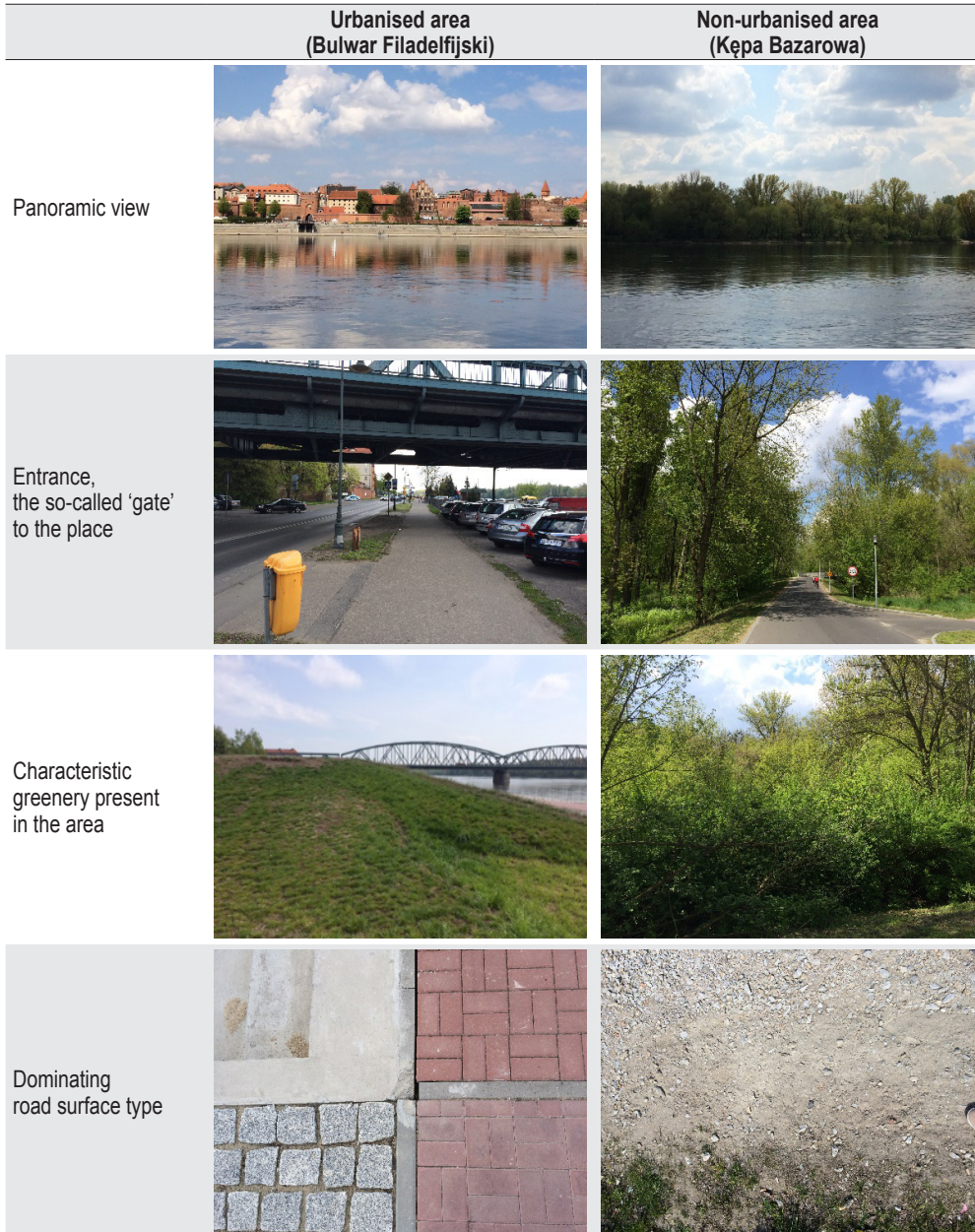
Table 1: Differences between the urbanized riverside area (Bulwar Filadelfijski) and the non-urbanized area (Kępa Bazarowa)

procedure, the authors determined the strengths and weaknesses in the performance of ecological and urban functions of the River Vistula in Toruń and assigned weights to them. Strengths include six elements, and from the viewpoint of residents and tourists the most important of them are: a meeting place and place integrating the local community. Among the five weaknesses established, the bad state of the water engineering structures was named as the most burdensome.