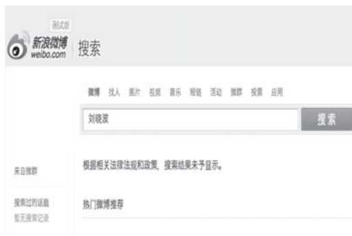
FIGURE 3. CENSORSHIP OF LIU XIAOBO IN WEIBO (SOURCE: BAMMAN, O'CONNOR, & SMITH, 2012:3)