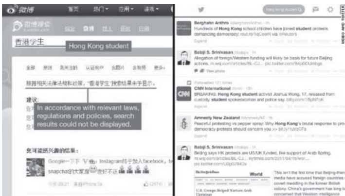
FIGURE 4. THE CHINESE GOVERNMENT CENSORSHIP OF THE HONG KONG DEMONSTRATION ON WEIBO

The notice was "In accordance with relevant laws, regulations, and policies, the search results could not be displayed". Another keyword such as Jasmine, Egypt, Ai Weiwei, Zengcheng, Beijing Occupy, Occupy Wall Street, etc. are also prohibited in Weibo (Bamvan, O'Connor, & Smith, 2012:3). The highest statistical forbidden keyword in the period of 2014 was Hong Kong because Chinese government assumed it could evoke reactions of citizens and repeat the tragedy of Tiananmen 1989 demanding democracy in China.