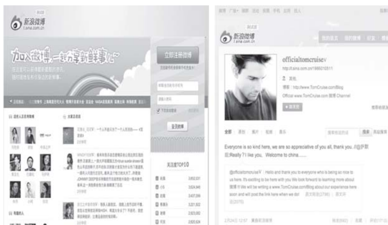
Figure 2. Weibo homepage and Hollywood Actor's official page

Weibo's fever has attracted some news sites and online portals to highlight the euphoria. Government, political elites, opinion makers, and academics in the country have their own Weibo. Even international celebrities open their own Weibo's page.