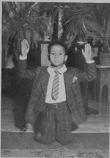
One of our little colored children making a storm-novena.