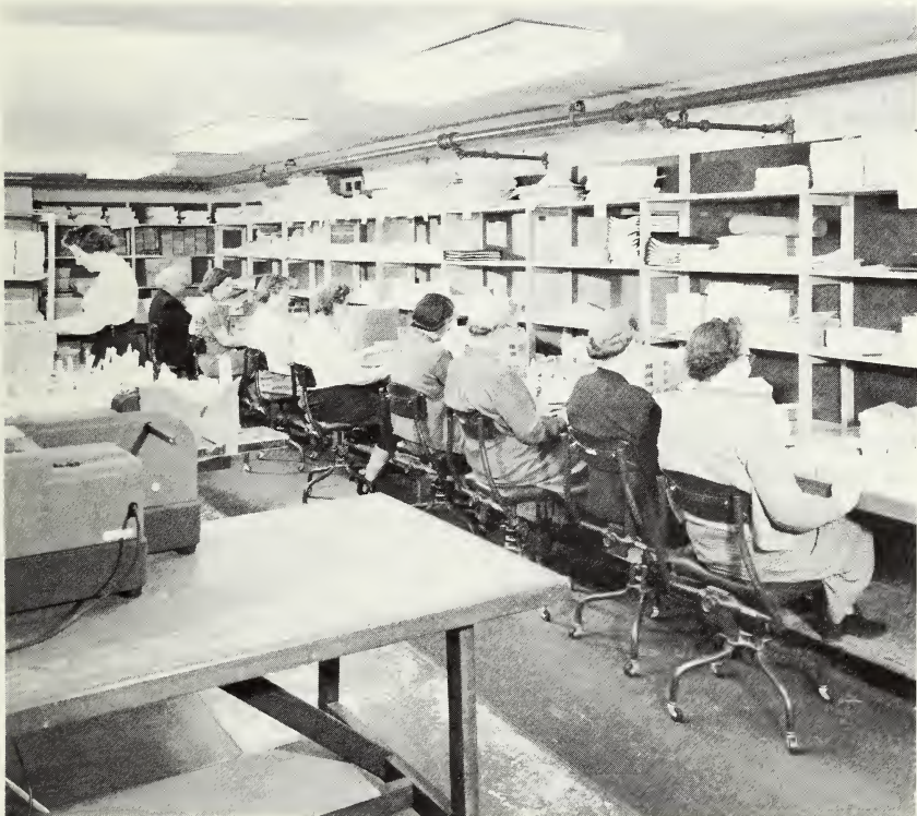
Part-time workers in FEE's basement mail room.

If the publications and other works of the Foundation are unacceptable to any donor, large or small, he is free to discontinue his support. That is the way it should be. And not infrequently, FEE pays that price of discontinued support for trying to be consistently honest in its work.