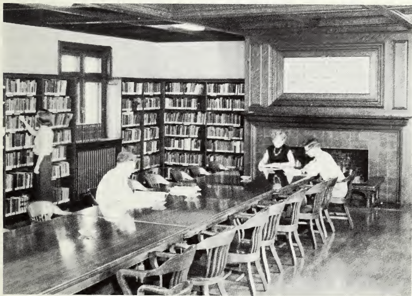
The Library and Board Room at Irvington headquarters.