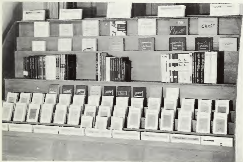
A display of FEE publications in the reception room at Irvington.

In addition to distributing pamphlets, booklets, and books, the Foundation also publishes a journal of libertarian opinion, THE FREEMAN . Each month this 64-page digest-size publication presents both timely and timeless ar-