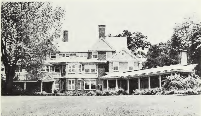
Foundation headquarters at Irvington-on-Hudson, about 20 miles north of New York City.

Why? Apparently it's because we don't know what freedom is. We don't understand the fact that small-scale compulsions within nations tend to grow into large-scale violence among nations. The person who desires to impose his will and viewpoint upon his neighbors in small ways "for their own good" is well on his way toward imposing his ideas upon