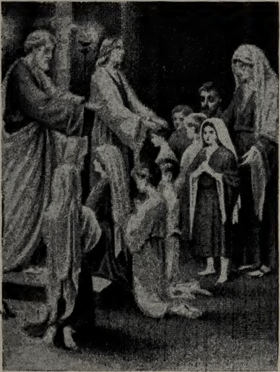
The Holy Ghost came down upon them in the form of tongues of fire.