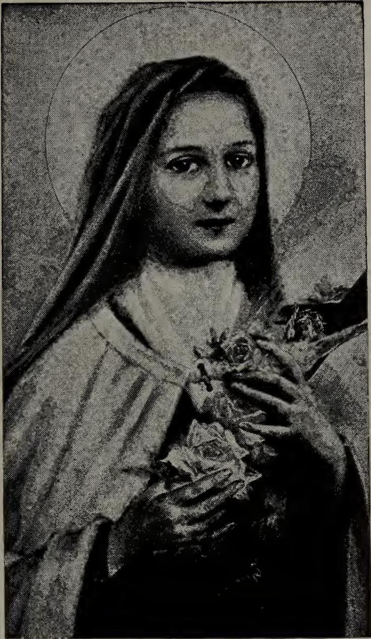
Saint Thérèse, the Little Flower, loved God very much.