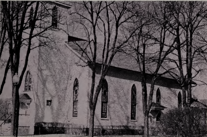
The original Shrine church.

People from other cities and countries began to make pilgrimages. The chapel had to be enlarged to accommodate the growing crowds. Later it was necessary to move the statue into the large city cathedral. The officials of the capital city adopted