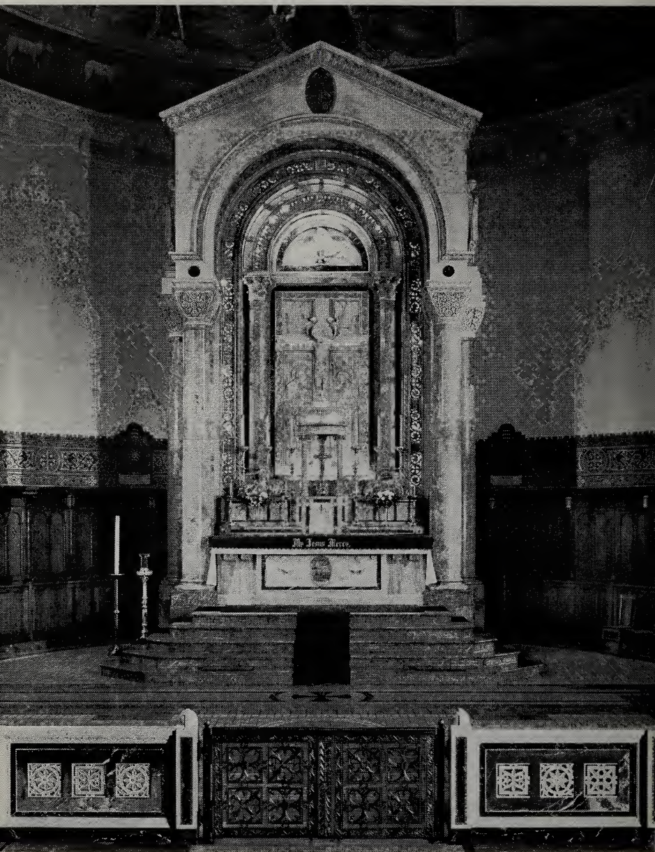
The Main Altar of Our Lady of Consolation.