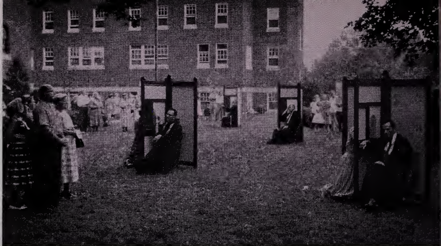
Outdoor confessionals accommodate a large group of pilgrims.

hastened to the church, and at the appointed time formed into procession, all with their expanded umbrellas. For a moment I had decided not to let the procession proceed, but considering that the people would be sorely disappointed I allowed it to start. . . . But behold, as soon as the statue was brought out of the church, the sun pierced the clouds and was shining on the whole line of the procession all the way to about a mile from Carey. It was continually thundering and lightning on both sides of us. When we came to within a mile from the village of Carey, the clouds from both sides clashed together right in front of the procession, and it seemed impossible for us to reach the church before the rain would pour down upon us. . . . When we reached the village of Carey, an immense crowd of spectators awaited us. The streets, the houses, the windows, even the very roofs were filled with people . . . all stood silent, and by far the greater part of them uncovered