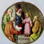
5th Joyful Mystery The Finding in the Temple

The Blessed Mother finds Jesus in the Temple.