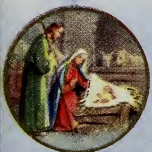
3rd Joyful Mystery The Nativity

The Virgin Mary gives birth to the Redeemer of the World.