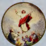
2nd Glorious Mystery The Ascension

Jesus ascends into Heaven forty days after His Resurrection.