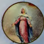
4th Glorious Mystery The Assumption

The Blessed Mother is united with her Divine Son in heaven.