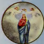
5th Glorious Mystery The Coronation

Mary is Gloriously crowned Queen of Heaven and earth.