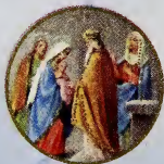
4th Joyful Mystery The Presentation

The Blessed Mother presents the Child Jesus in the Temple.