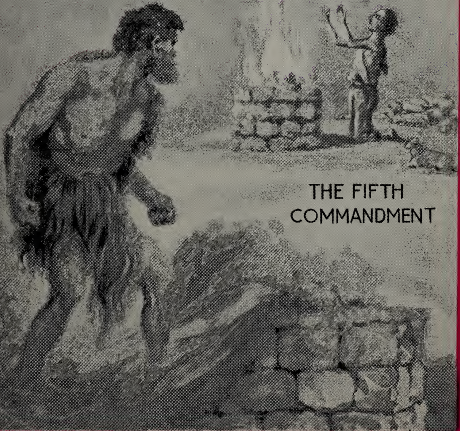
THE FIFTH COMMANDMENT