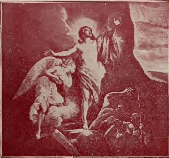
Christ Rising from the Tomb