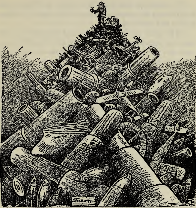
Talburn, in the Washington (D. C.) Daily News. "THE SERMON ON THE MOUNT"

money left to give to each city of 20,000 inhabitants and over in all the countries named a $5,000,000 library and a $10,000,000 university. Out of the balance we could have still sufficient money to set aside a sum at 5 per cent interest which would pay for all time to come a $1,000 yearly salary each for an army of 125,000 teachers, and in addition to this pay the same salary to each of an army of 125,000 nurses."