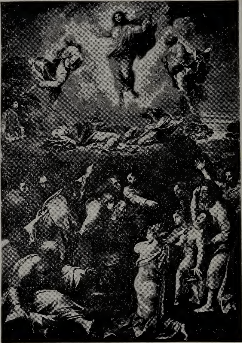
Jesus arose again from the dead.