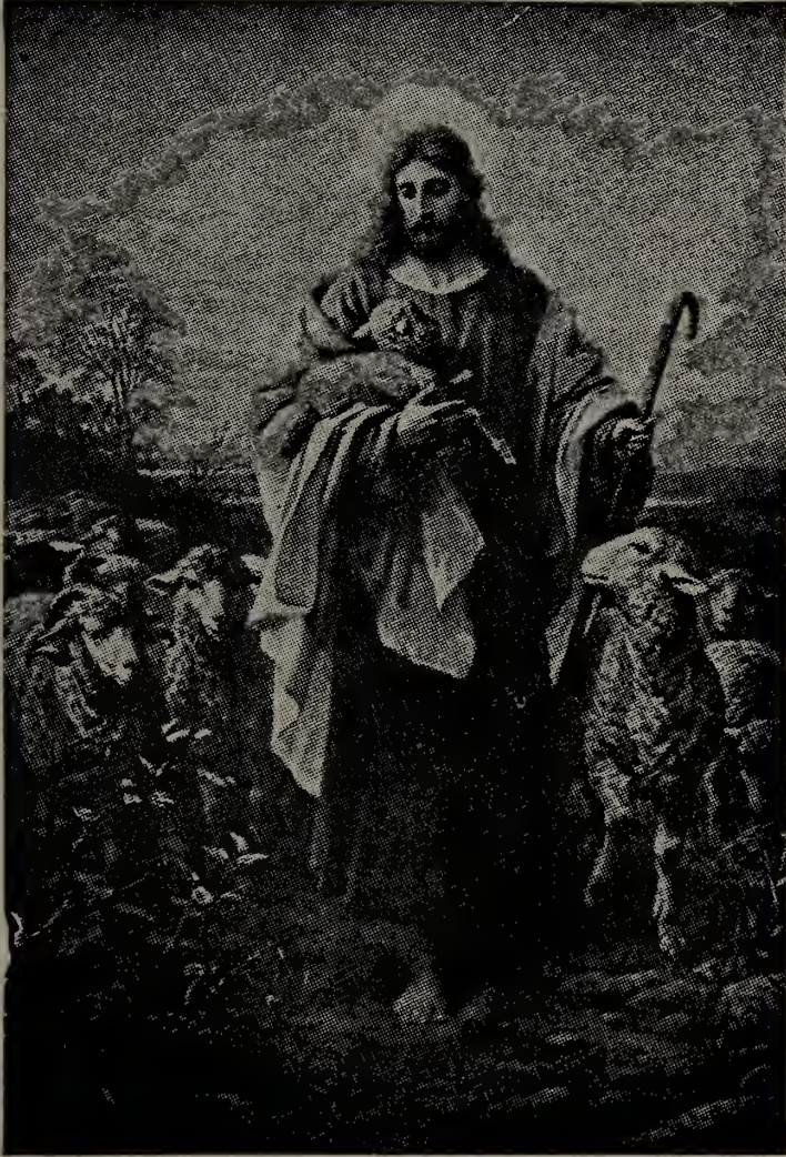
Jesus, the Good Shepherd