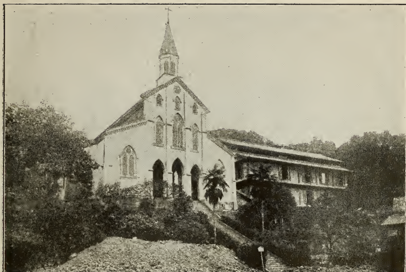
CATHOLIC MISSION AND SEMINARY AT NAGASAKI, JAPAN.