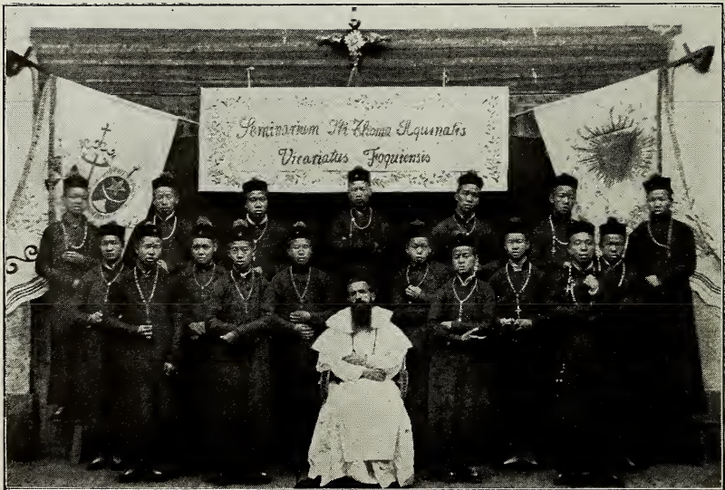
THE STUDENTS OF ST. THOMAS' SEMINARY AT FOOCHOW, FOKIEN, CHINA.