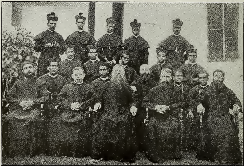
STAFF OF PROFESSORS (O.C.D.) AND NEWLY ORDAINED PRIESTS AT THE PAPAL SEMINARY OF PUTHENPALLY, INDIA.