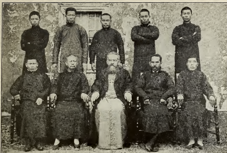
BISHOP RAYSSAC AND NATIVE PRIESTS OF THE VICARIATE OF SWATOW, CHINA.