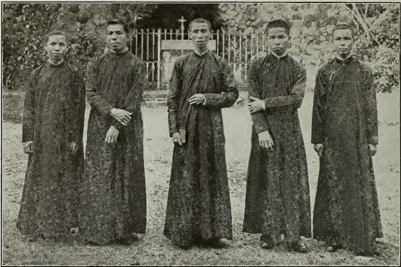
FIVE ANNAMITE PRIESTS ORDAINED IN 1917.