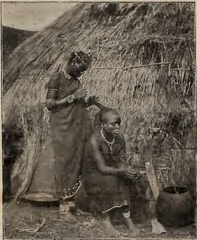
SOUTH AFRICA: KAFIR WOMEN HAIRDRESSING. (See p. 94.)

The motto of Cardinal Lavigerie "Instauranda Car-