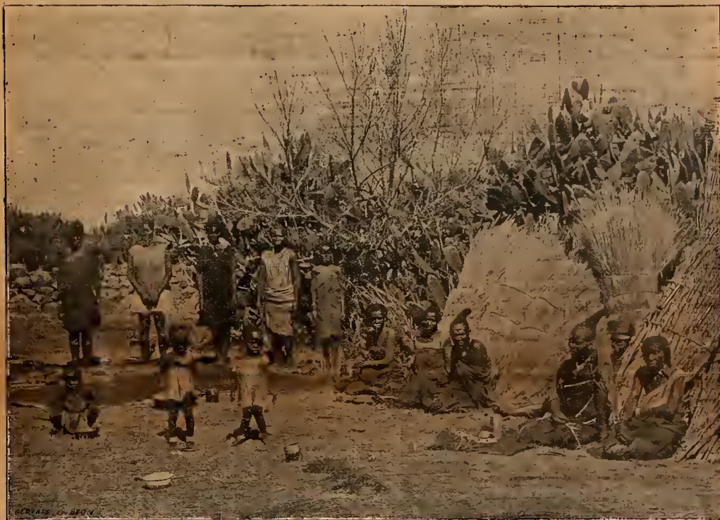
SOUTH AFRICA: THE BASUTOS AT HOME. (See p. 94.)