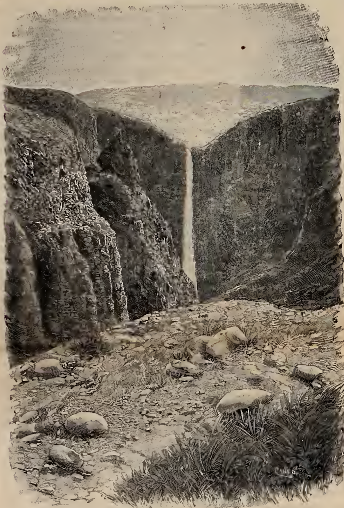
SOUTH AFRICA: THE "BIKAN," WATERFALL IN BASUTOLAND. (See p. 94.)

the serene consciousness of the good trick I had been playing the ants. They, on their side, must have guessed I did so, and there and then have sworn to take a signal revenge; for to my utter discomfiture, the next morning I saw as many ants on the new cover as I had seen the day before on the old one. They had spurned my liniment of soap and had actually been gnawing vigorously at the sal plank. However, as you know, there is no end to man's ingenuity, as is daily proved by the numerous inventions made in all departments of science and of practical life. I was determined to have the better of the ants. So, I too set myself a-thinking bent upon an invention in the hitherto little explored department of lavaho lids, under the peculiar conditions obtaining in countries infested by white ants. Very probably the old specimen of old English pottery