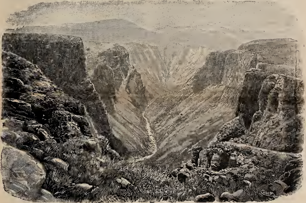
SOUTH AFRICA: COURSE OF THE MALUTWENYANA RIVER IN BASUTOLAND. (See p. 94.)

Do you wish to hear something more of these strange little creatures? If the pieces of timber they have set themselves to demolish are large, they make their nests in them and live in them till they acquire their perfect state of life, i. e., until they become winged; and they do not leave it before having left behind them a new generation to continue the work they have begun. Then one evening, you will see