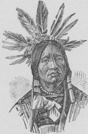
A SIOUX CHIEF.

My messengers were faithful to their charge. The people gathered in great numbers. After the sermon I visited their lodges and was everywhere cordially welcomed. Two days later I set out once more for Oxford House. The hospitality offered to me by an English family made me forget for a while the discomforts of my long voyages. There the Indians are all Crees, and I found souls well prepared to hear the truths of our holy religion. I hope we shall have at this place, before long, a mission that will be a source of consolation to the missionary. But everything is yet to be done, and our resources are smaller than our debts. Nevertheless, we have confidence in the future of the station.