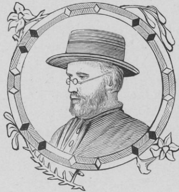
FATHER DAMIEN, Apostle of the Lepers.

of charity, chastity, and mildness succeeded their infamous practices and barbarous customs. In the midst of this people there arose a community of celibates, among whom one of the princes attained successively all the sacerdotal degrees.