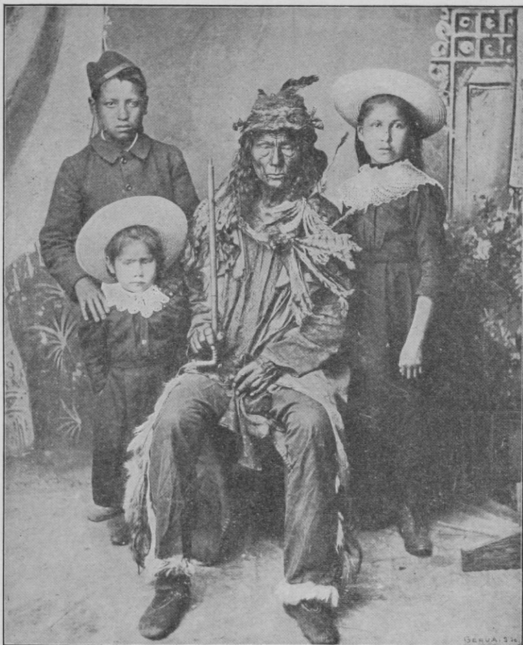
MANITOBA CHIEF AND CANADIAN CHILDREN.

"Father," they said, "for a long time we have wished to be