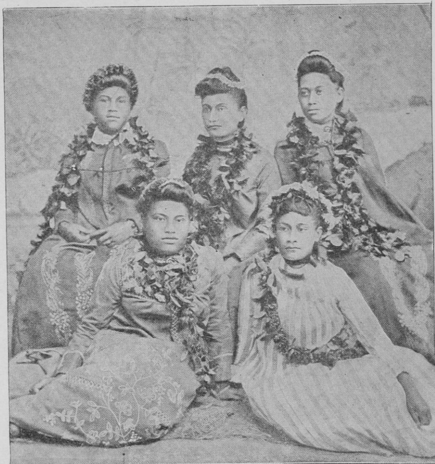
HAWAIIAN WOMEN OF HONOLULU.

He began by founding a school, but the children could not be induced to attend it. They were afraid of being eaten. Little by little, however, these fears and the prejudices of the natives disappeared.