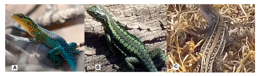
Fig. 2. Species of Liolaemus lizards recorded in the study area. A — L. tenuis ( ^{\odot} G. Zúñiga); B — L. pictus ( ^{\odot} A. H. Zúñiga); C — L. lemniscatus ( ^{\odot} A. H. Zúñiga).

Regarding the effect of the treatments on the abundance of recordings of species, it was observed that all species showed differences in those terms, where L. tenuis was absent in the high severity treatment (Kruskal-Wallis test, H = 20.996, p < 0.0001, d.f.: 2). The rest of the species, although they were present in all treatments, also differed in their abundance of recordings (H=16.348, p=0.001; H=8.993, p=0.03 for L. pictus and L. lemniscatus, respectively; g.l.: 3 in all cases). The use of microhabitats varied through species and treatments (fig. 3), which can be reflected in their respective niche amplitudes (table 2), with a declining trend as the severity increased. In the control, although the three species used the three microhabitats, L. tenuis stood out for its predominant use of trees, while the other two species were more linked to the use of logs and ground. In the case of low severity treatment, it was observed that both L. pictus and L. lemniscatus used all three types of microhabitat, while L. tenuis was absent on the ground. It was observed that the effect of treatments showed different patterns of microhabitat use, as was the case for L. pictus (Kruskal-Wallis test, H = 13.831, p = 0.001; H = 7.864, p = 0.020; H = 19.557, p < 0.0001 for control, low severity and medium severity treatments, respectively; use of trees were lesser than the other microhabitats, Tukey test, p < 0.05), and high severity treatment (Mann-