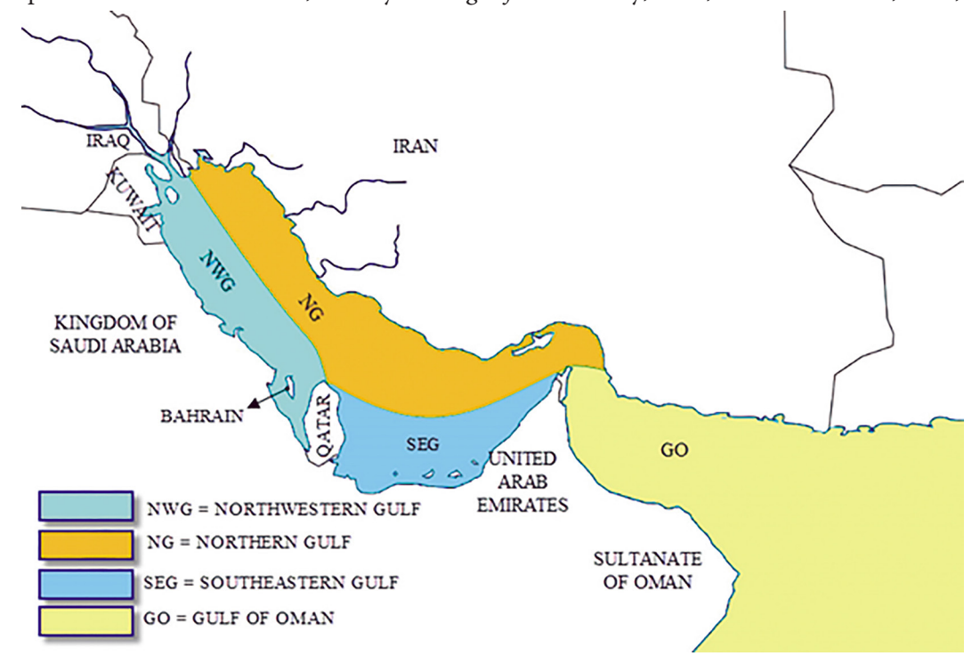
Fig. 3. Distribution of marine gastropods in the Arabian Gulf.

The genus Turritella Lamarck, 1799 of the family Turritellidae is represented by seven species in the Arabian Gulf, namely: T. cingulifera Sowerby, 1825, T. cochlea Reeve, 1849,