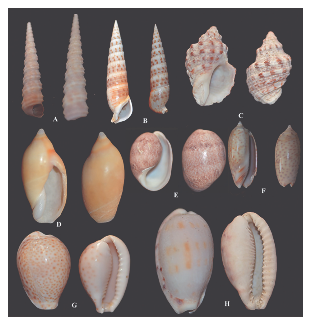
Fig. 1. A — Turritella cochlea Reeve, 1849; B — Rhinoclavis fasciata (Bruguière, 1792); C — Semiricinula tissoti (Petit de la Saussaye, 1852); D — Ancilla castanea (G. B. Sowerby I, 1830); E — Bulla ampulla Linnaeus, 1758, F. Oliva bulbosa (Röding, 1798); G — Naria turdus (Lamarck, 1810); H — Erronea caurica quinquefasciata (Röding, 1798).

Genus Turritella Lamarck, 1799 Turritella cochlea Reeve, 1849 (fig. 1, A; 40 mm)