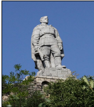
Figure 3. “Alyosha” monument to the Soviet Soldier-Liberator in the Bulgarian city of Plovdiv

danger. In reality, however, since 1989, the authorities tried three times to carry it as a symbol of “the Soviet occupation”. Eventually, in 1996 the Supreme Court of Bulgaria adjudicate that the monument is a monument of World War II and cannot be destroyed.