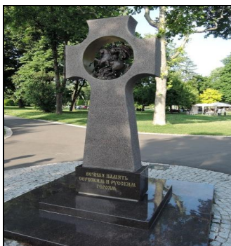
Figure 2. The memorial sign in honor of the Russian and Serbian soldiers in Belgrade

A special place in the network of the military-historical heritage monuments occupies the joint struggle of the Slavic peoples for their freedom and independence. It is symptomatic that all the examples are more frequent review of this point of view the Slavic peoples’ history. This is, in particular, a monument in honor of the Russian and Serbian soldiers who died defending Belgrade, recently installed in the historic part of the Serbian capital (Figure 2).