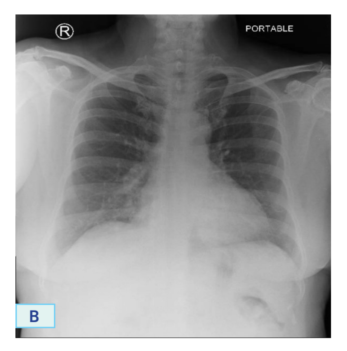
Fig. 1. Chest radiographic image

Fig. 1A. Initial X-ray: pneumonia, both lower lobes. Fig. 1B. Repeat image: regression of pneumonia.