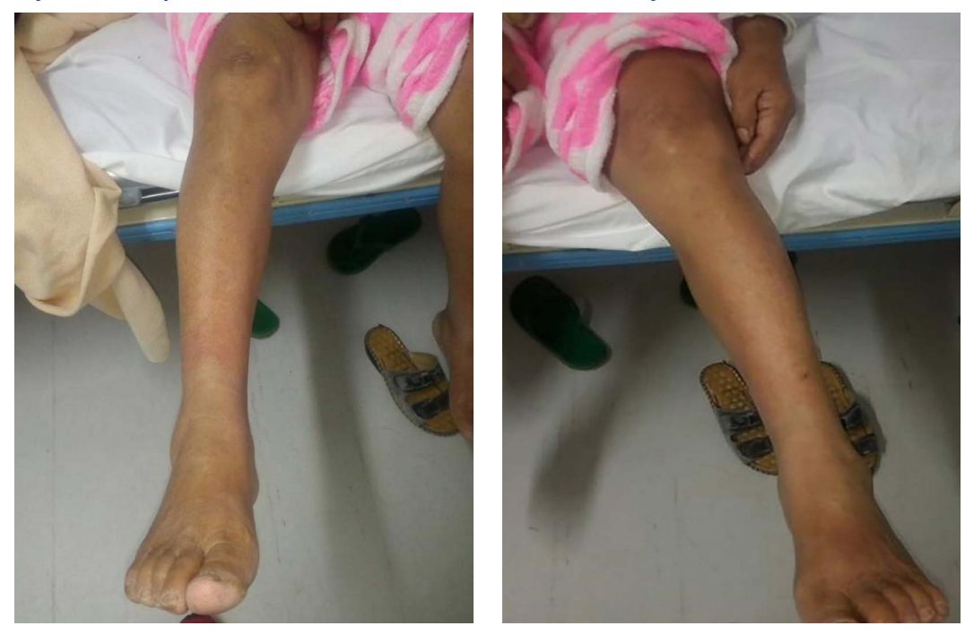
Fig. 2. Erythematous petechial rashes on the lower extremities on day 7 of illness

for the diagnosis of dengue. However, the only diagnostic tests available to the institution were the RDTs for dengue IgM/IgG and the NS1 antigen. The Handbook for clinical management of dengue notes that diagnosis of dengue infection is confirmed by the detection of the virus, the viral genome or NS1 antigen, or by seroconversion of IgM or IgG (i.e. from negative to positive).<sup>5</sup> Thus, the positive NS1 antigen test in this patient supported the diagnosis of dengue. The negative IgG and IgM may have been due to the timing of the collection of serum, given that dengue IgM serology has been shown to have low sensitivity during the early phase of dengue fever.<sup>7</sup> However, a negative antibody serology does not rule out dengue fever, especially when the dengue NS1 antigen test is positive. Samples taken from the patient on days 5 and 8 of hospitalization showed seroconversion of IgG but not of IgM. Given that the patient resided in a locality where dengue is endemic and cases have been reported, and had symptomatology and physical examination results suggestive of dengue fever, the combined positive NS1 test and the seroconversion of IgG improved the accuracy of the dengue fever diagnosis in this case.