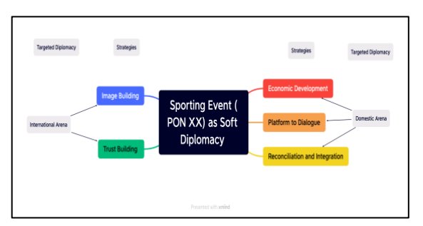
Fig. 2. Sporting Event as the strategy of soft diplomacy

employed sports diplomacy by hosting national games PON XX in Papua constitutes an instrument of soft power. The first mechanism is International Image-building by constructing infrastructure in Papua would brush off the allegation that the government has left Papua behind in development. Second, sports diplomacy can be a platform for dialogue between the government and the local people. Third, hosting PON XX in Papua would build trust among stakeholders involved in this event, such as central government, local government, local communities, individuals. Fourth, from the economic perspective, PON XX has positively contributed to boost economic sectors in Papua like construction, transportation, and hospitality. The national sprots event provides a fast-track economic development towards government and people in Papua. The finally, as sport used as an instrument of soft diplomacy, the government hopes that it can be a catalyst for achieving reconciliation and integration to the separatist group in Papua to rejoin with NKRI (Negara Kesatuan Republik Indonesia).