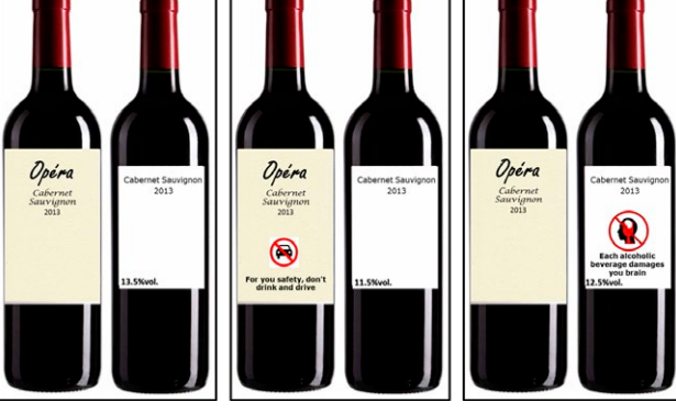
Figure 1. An example of choice task for wine and beer.

mised the expected D-errors<sup>1</sup> (Ferrini and Scarpa, 2007; Scarpa and Rose, 2008; Sándor and Wedel, 2001). The final designs included 12 choice scenarios composed of three bottles each. In order to rationalise the response time to the questionnaire, three blocks of four choice scenarios were created adopting the blocking procedure. In this way, each respondent faced the choice of the preferred bottle of beer among four groups of three bottles and the choice of the preferred bottle of wine among four groups of three bottles each.