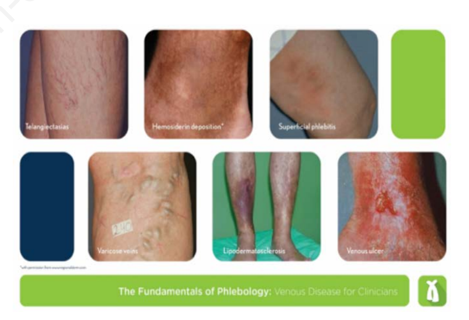
Figure 1. The spectrum of venous disease.

Well-performed compression techniques do not guarantee technical success. More commonly, however, recurrent varicose veins can be from non-saphenous sources such as pelvic insufficiency, saphenous tributary incompetence, previously