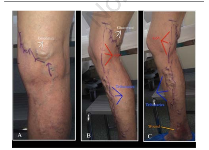
Figure 2. Patient 78 years old with mixed shunt which causes severe symptomatic chronic venous insufficiency with trophic ulceration (C2,3,4,5,6sEpAs+dPr+o13,2,3,5 according to CEAP classification).