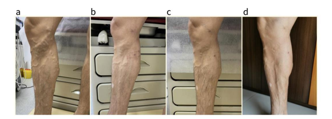
Figure 3. Case A. a) preoperative; b) 1 month postoperative; c) 4 month postoperative; d) 12 month postoperative.