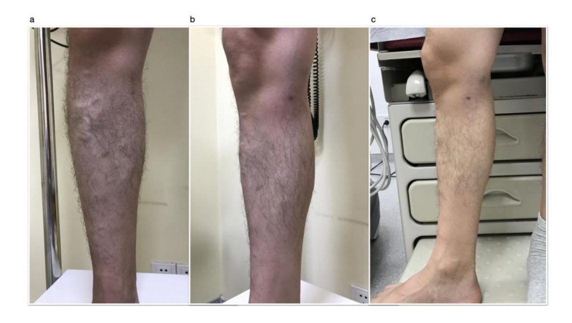
Figure 4. Case B. a) preoperative; b) 1 month postoperative; c) 12 month postoperative.