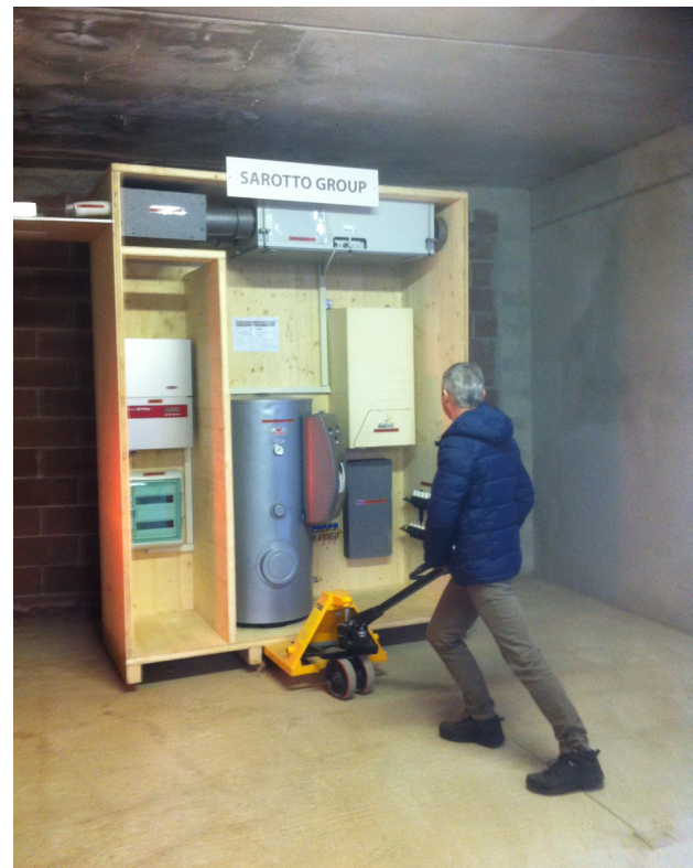
Figure 5. The MOTE2 mock up handling after the service cupboard assembling.

The service cupboard - once will be available for the construction market - might be included among the cutting-edge integrated building services. The last phase of the research was focused to point out the MOTE 2 's value proposition. MOTE 2 can be stand out