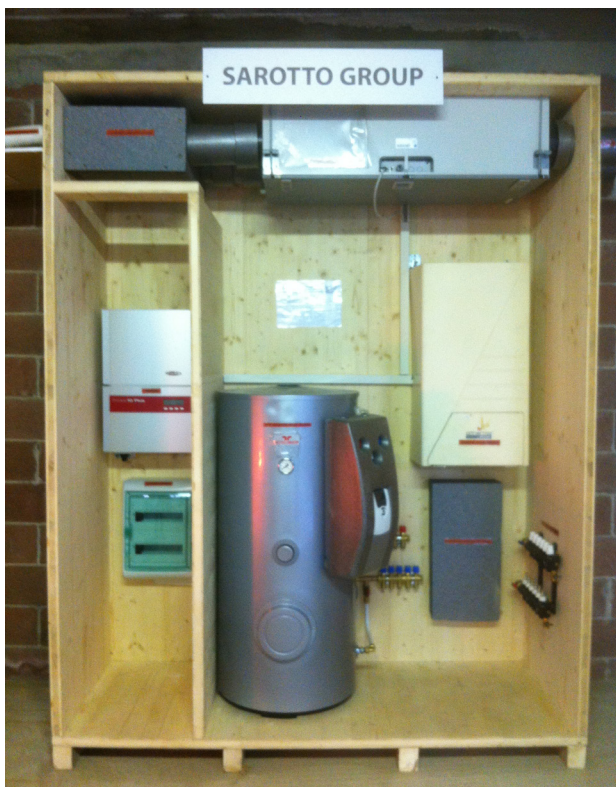
Figure 4. The MOTE2 mock up.

based on a comprehensive set of requirements to be assessed in the different design and assembling stages has shown its effectiveness and value. On the whole the difference between the design and the mock-up was trivial. In particular the S Size services cupboard dimensions (length, width and height) were comparable to the M cupboard described previously. The mock-up photo is reported in figure 4. On the left - between the shell and the partitioning - were placed the electrical devices. On the top was installed a combined service for mechanical ventilation and cooling. Finally in the central part were positioned the heating service and the DHW system. The mock-up was 10 cm suspended from the floor