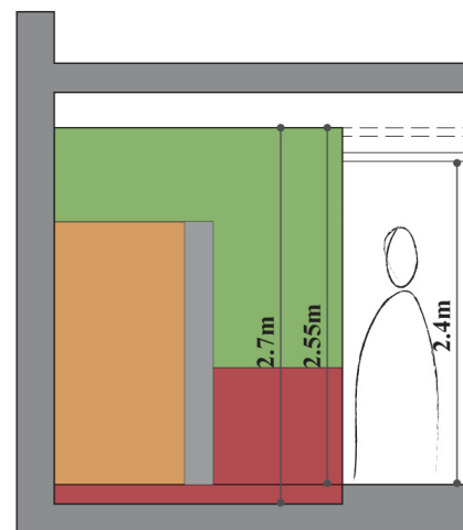
Example of a services cupboard design for the building model "M" Size. The isometric views show the envelope of the each services and their combination into the cupboard.