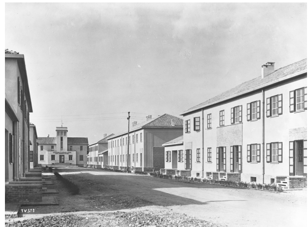
Figure 16. Workers' houses type 4-BIS in 1948, Torviscosa, IT.

First of all, the quarry of Cave del Predil and the plant of Torviscosa surrounding areas are still tackling relevant environmental issues resulting from the heavy impact and pollution of the former industrial activities (mining and chemical production), so that brownfields reclamation needs are constantly discussed as a priority.