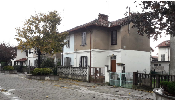
Figure 15. Panzano workers' houses after renovation works (authors, 2019).