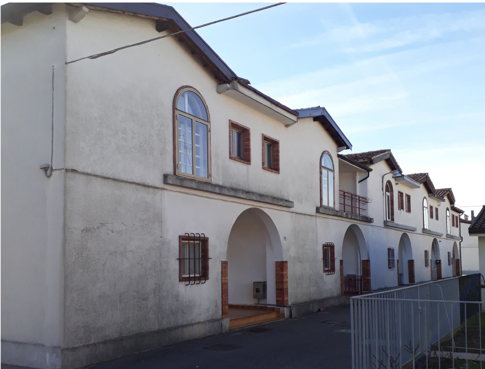
Figure 19. Workers' houses type 01M in Torviscosa, IT.