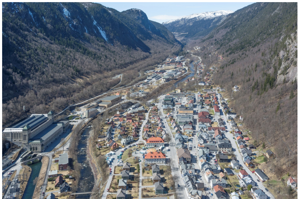
Figure 11. New Town (house type O), Market square and Tyskerbyen housing area, Rjukan Hydro Town, NO (Per Berntsen, 2013).

According to the best practices, in order to preserve the built heritage and to intervene in the appropriate way, it would be advisable to assess the actual state of the buildings by carrying out a survey activity on architectural (plans, sections, elevations) and construction elements (materials, building techniques, degradation), in the first phase. A careful evaluation of the energy balance, of the heat losses of the envelope, and of the climate condition of the surrounding environment will enable the identification of all the parameters which contribute to the definition of the possible compatible retrofit works. The orientation and solar irradiation of the building also fosters bioclimatic approaches, which take advantage of the free thermal gains for heating during the winter seasons, and protect from overheating - i.e. through vegetation and shading devices - during the summer, without any deep-renovation of the building. The observation of the orography and of the rainfall can be helpful to propose strategies for the sustainable