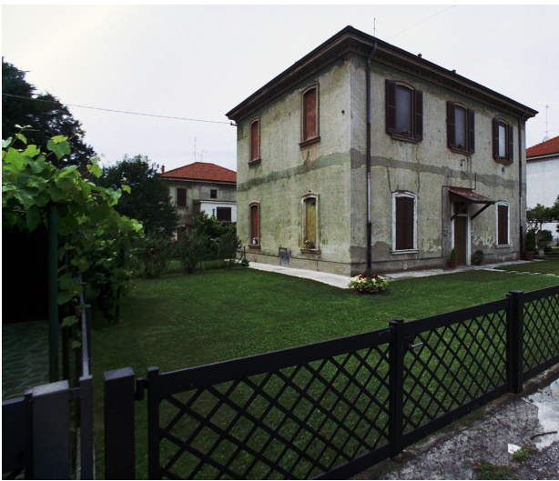
Figure 10. Worker's house in Crespi d'Adda, IT (Ian Spackman, 2007).

comfort, and environmental sustainability.