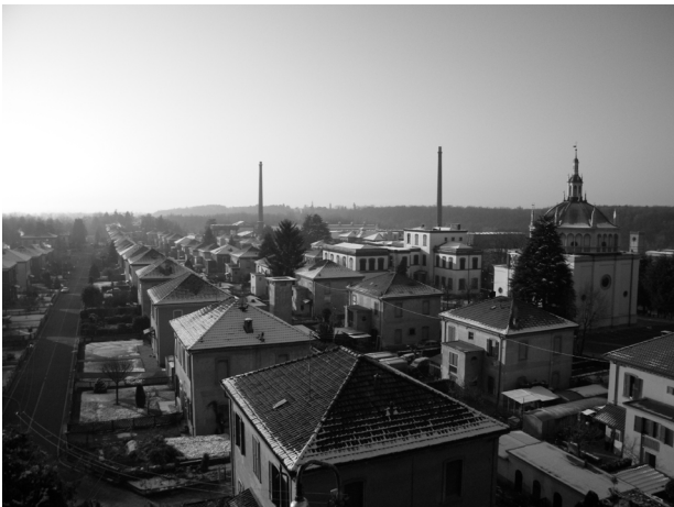
Figure 3. Crespi d'Adda site, aerial view, 2009.

The company towns to be investigated have been subsequently identified also according to the availability of detailed historical-critical and technical studies already completed, as well as according to protection and conservation initiatives currently under way. The presence of this documentation has thus enabled the evaluation of the prevalent measures of protection, restoration and enhancement adopted in the international context for the company towns. Then, three company towns in the local area have been presented as case studies for the application of possible retrofitting strategies on the residential heritage.