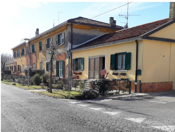
Figure 18. Workers' houses type 01M in 1945, Torviscosa, IT