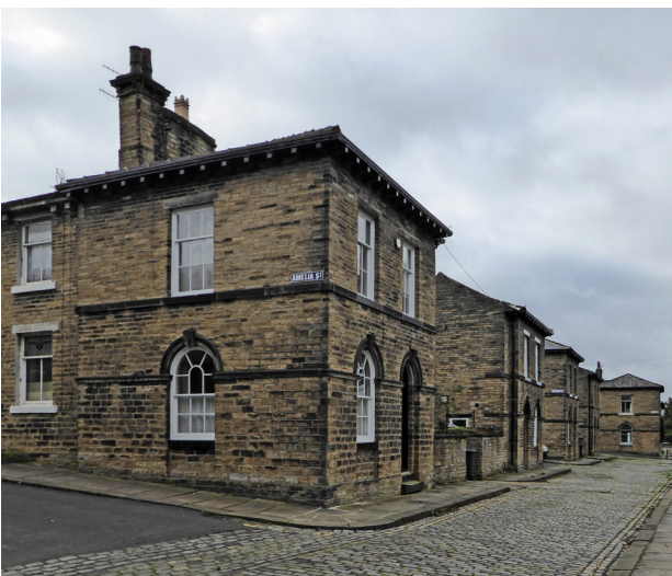
Figure 8. Houses in Saltaire, UK (Tim Green, 2017).