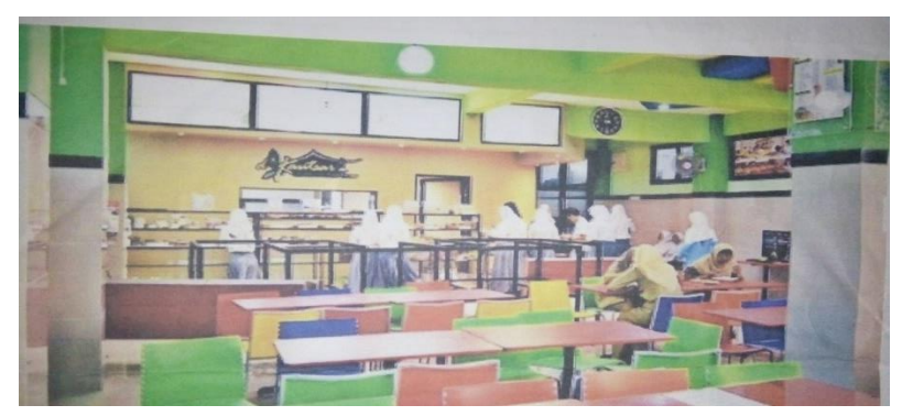
Figure 7. Canteen, by Hanif, Alhidayah, Indah, Muliya, May, khaonaeni.

The canteen is a room in a public building that can be used by students to eat, not only to eat, the canteen also the place that the students were gathering and sharing information with others.