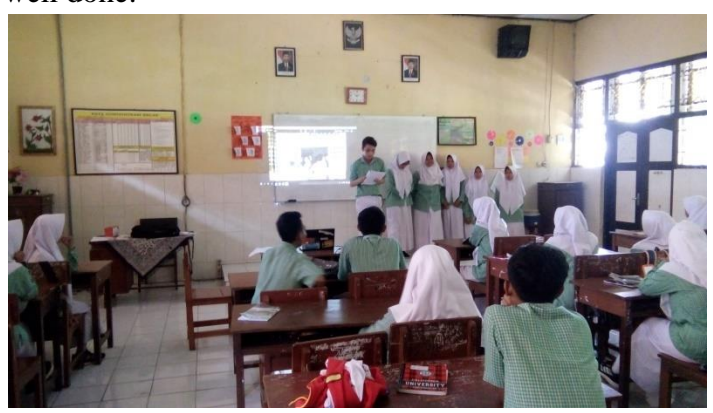
Figure 3. Presentation.

The seventh meeting was conducted on Monday, 15<sup>th</sup> of April 2019. We set up a display with an LCD projector to help the student presentation, and to make interested. Many photos were shown in front of the class. Then the students saw their friends' presentation in forward, explained the photos; students argued the photos, and exchanged information. In reality, the students felt confident to speak up in forward, although they still struggled in pronunciation, all presentations were well done.