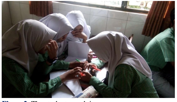
Figure 2. The students work in a group.

The sixth meeting was conducted on Tuesday, 11<sup>th</sup> of April 2019. The students continued to complete writing their text and make sure that they had a good preparation for the presentation in front of the class in the next meeting.