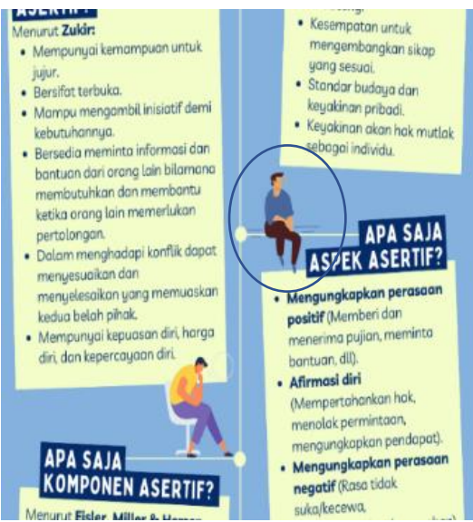
Figure 4. Illustrations and image captions

Based on figure 4. The images used are not correlated with what is described in the infographic media, a good infographic can correlate images with