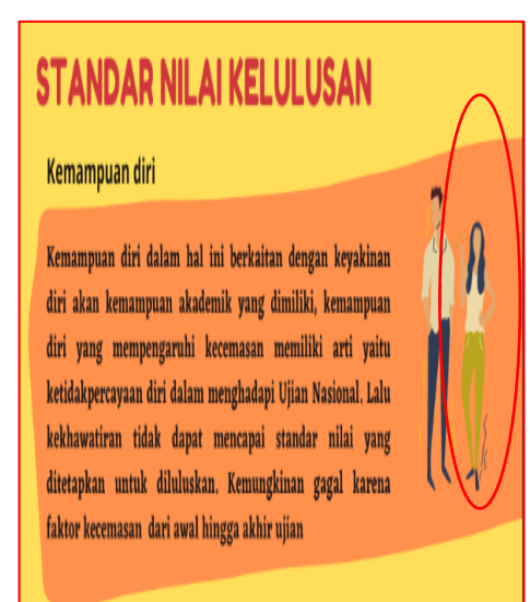
Figure 5. Reveal the meaning of the object.

Based on figure 5. It can be seen the lack of it that there are still some uses of objects that do not fit the meaning of the material contained in the infographic