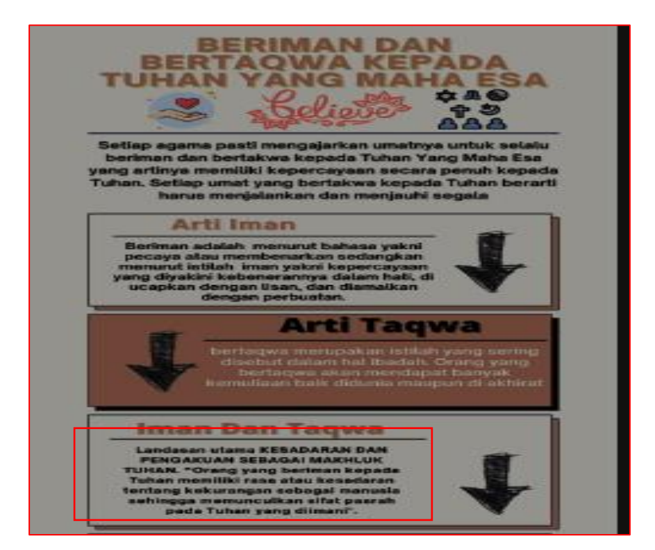
Figure 9. Less effective in sentences,

this must be given direct explanation by guidance and counseling teachers