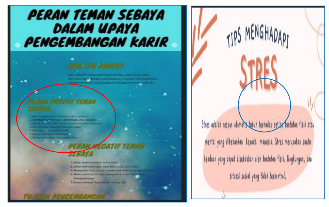
Figure 2. Separation between sentences

the explanatory sentence and for the sentence, the incarnation must be consistent with the left, right, upper, and lower borders so that no explanatory sentence is attached to the edges.