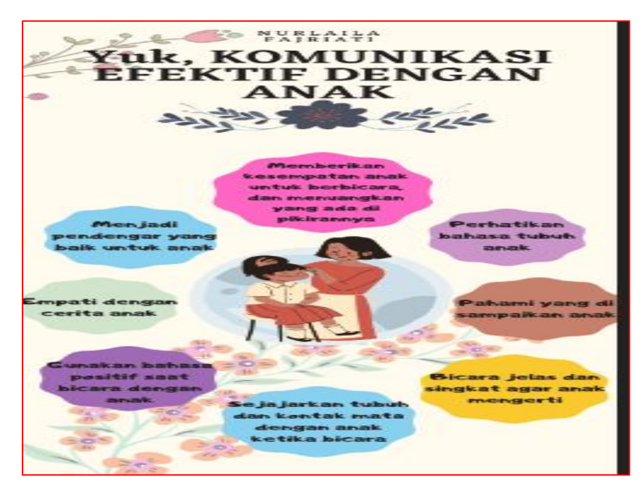
Figure 8. Depth of Matter,

although interrelated but very limited to the material made without associating with other material.