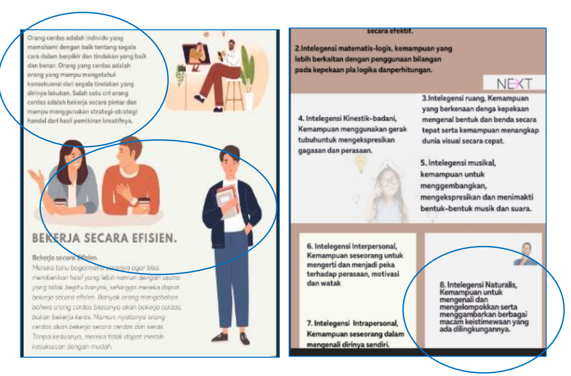
Figure 1 . Layout element placement.

The picture above shows the lack of consistency in the good location of the image placement and text that is not ideal such as explanatory sentences that are not reached at the edge of the worksheet. For the particular improvement of the location of the image adjusted to