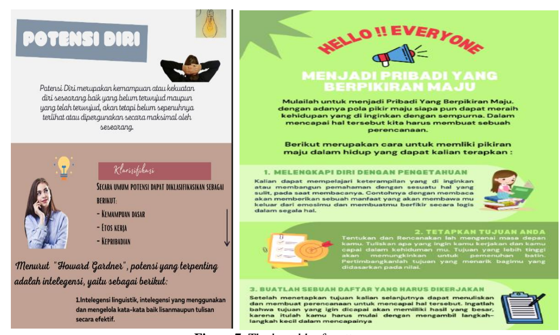
Figure 7. The breadth of matter,

material is good for use in infographic media. Based on the Material Assessment indicator can be seen from several representative images below the shortcomings of infographic media, namely.