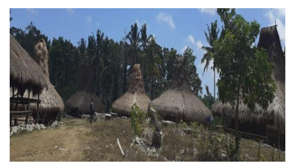
Figure 3. The Condition of Traditional Villages in Sumba

distance between the springs and the village, women and children are usually the ones who are responsible for fetching water. For a few rural villages and hamlets having vehicle access roads, the men take water using motorbikes or pick-up trucks. There are also people who are forced to leave their original villages due to the difficulty of clean water (Silitonga & Rizal, 2021). They then built a new village adjacent to access to clean water