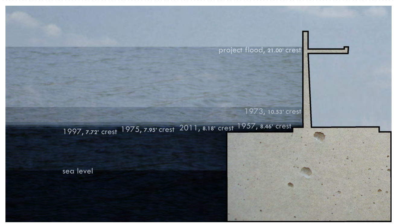
Flood crest heights found on the National Weather Service website, diagram by the authors

In response to a massively destructive flood of the Mississippi in 1927, Congress directed the US Army Corps of Engineers to find a way to control the Mississippi. The Corps began an ambitious control project that included dramatic changes to the Atchafalaya Basin, an area formed by the Atchafalaya River, a tributary of the Mississippi also hit hard by the 1927 flooding.