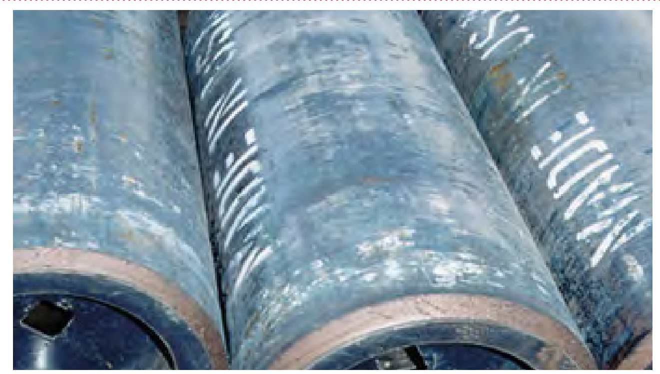
Sub Surface Tools Inc.

Morgan City, located off of the Atchafalaya River in Louisiana, was hit by severe rain to such a high degree that Morganza Spillway had to be opened for only the second time in history. As a result, there was flooding throughout many parts of Morgan City in the spring of 1973. Recently, during the summer of 2011, Morgan City experienced high rising water once again. What began as a small inconvenience for a couple of businesses close to the Mississippi's bank, quickly became a major point of concern for many businesses and residents on the protected side of the city's flood wall.