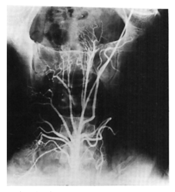
Fig. 3. Patient 21, a man aged 42 years. Total cerebral infarction following an operation for subdural hematoma. Selective angiography of the superior mesenteric artery. No drugs were given during the examination. Note that in addition to segmental spasm there is a distinct spasm at the origin of arterial branches.

sible kidney donation. Six patients with atherosclerosis were excluded. Of the remaining 30 patients, 14 were women and 16 men. The age and sex distributions are shown in Fig. 1.