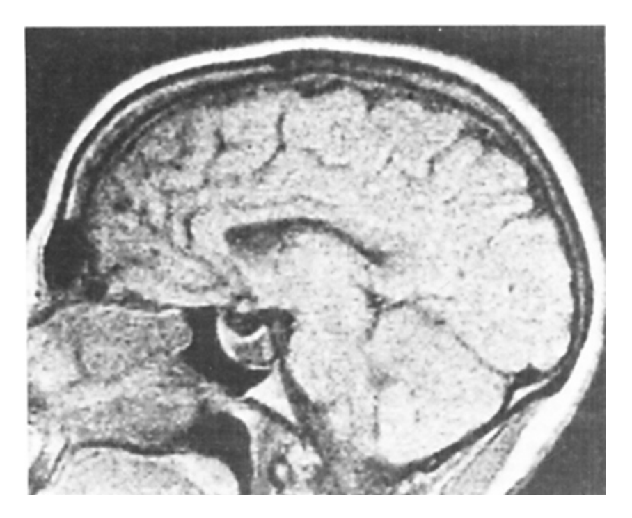
Fig. 3 At 10 months follow-up MRI showed the same tumour size as in Fig. 2.