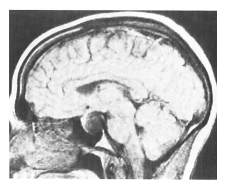
b) subtraction image showing the cystic part of the tumour.