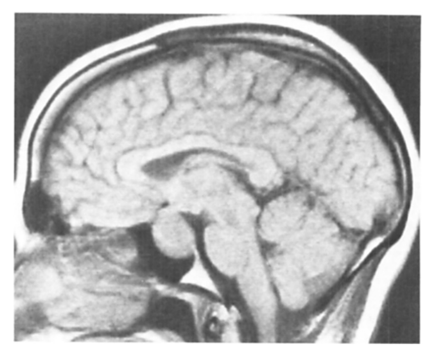
Fig. 1 Midsagittal MR image of the pituitary tumour with suprasellar extension a) T1 weighted image;