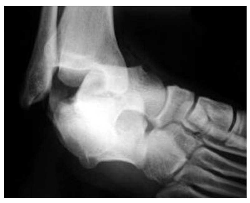
Fig. 2A. Plain radiographs showing posteromedial dislocation of the ankle joint without fracture (anteroposterior view).

artery was palpable. Sensory disturbance was found in the dorsum of the foot. Plain radiography showed that talus was dislocated posteromedial to the tibia. No fracture was demonstrated on plain radiography (Fig 2A). Joint laxity of the wrist and ankle was found. Surgery was performed on the same day as the injury occurred. The ruptured skin was extended to expose the damaged parts. The anterior part of the tibiotalar joint capsule was detached from the original tibial site. The anterior talofibular ligament was irregularly torn from its attachment to the lateral malleolus. The calcaneofibular ligament was also