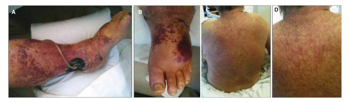
Figure 1. Palpable purpuric rash on the left lower extremity (A and B) and back (C and D) following antibiotic therapy.