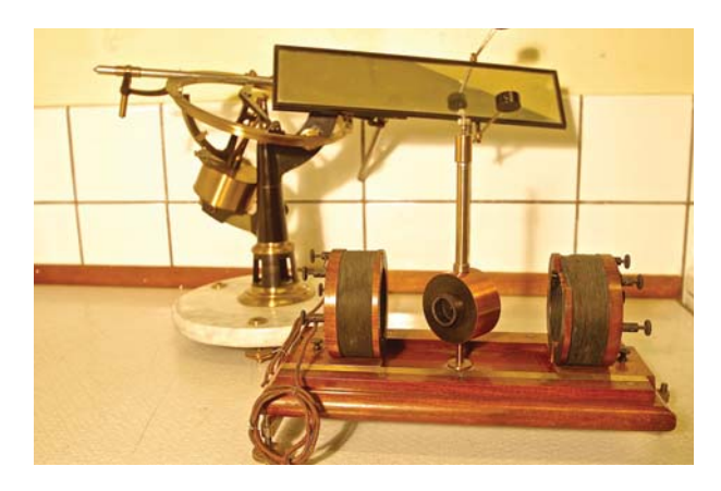
Figure 1. The equipment Holmgren used when he detected the retina current. The apparatus belongs to the Museum of Medical History in Uppsala.

modern electronic equipment, electroretinography has today become a valuable tool in the diagnosis of eye diseases in humans and animals.