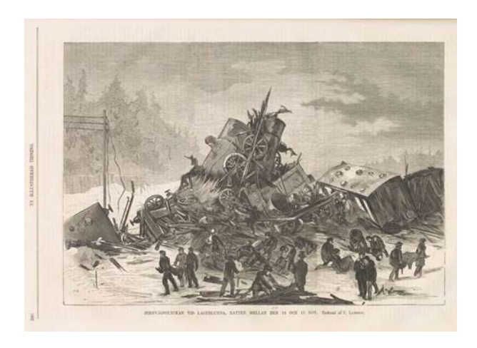
Figure 3. The railway collision in Lagerlunda. A sketch by Carl Larsson in Ny Illustrerad Tidning, 20 November 1875.