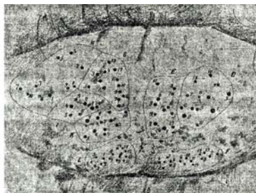
Figure 6. Hjalmar Öhrvall and the tip of his tongue magnified twice. The picture is drawn according to a photograph and shows the position and relative size of the papillae fungiformis referred to in his thesis. (UUB, Kart- och bildenheten, ID 7255).