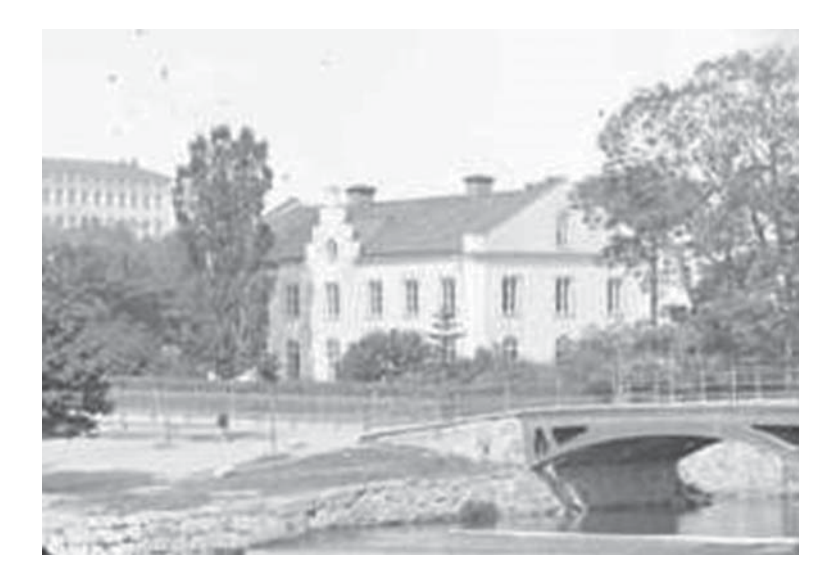
Figure 3. The building where Sandström discovered the parathyroid gland.

thoughts and of trustful communication of personal experiences and impressions. Nothing of the kind was seen ... everyone seemed to be there with the intention of showing what 'discoveries' he had made and at the same time give the astonished world the opportunity to have a look at the fortunate discoverer. But for the discovery itself, for the revealed truth, the interest was little or none.