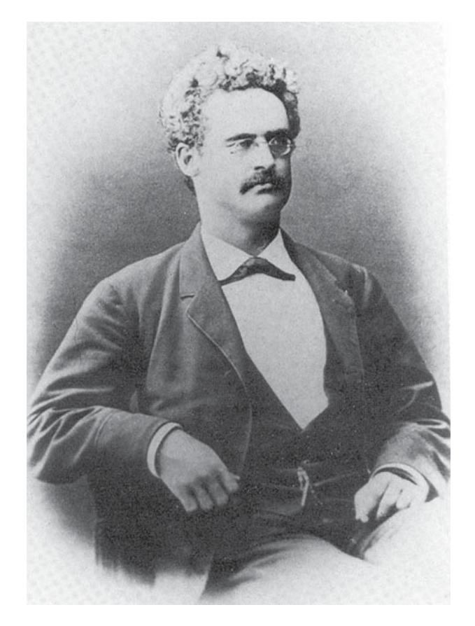
Figure 1. Ivar Sandström, 1852–1889.