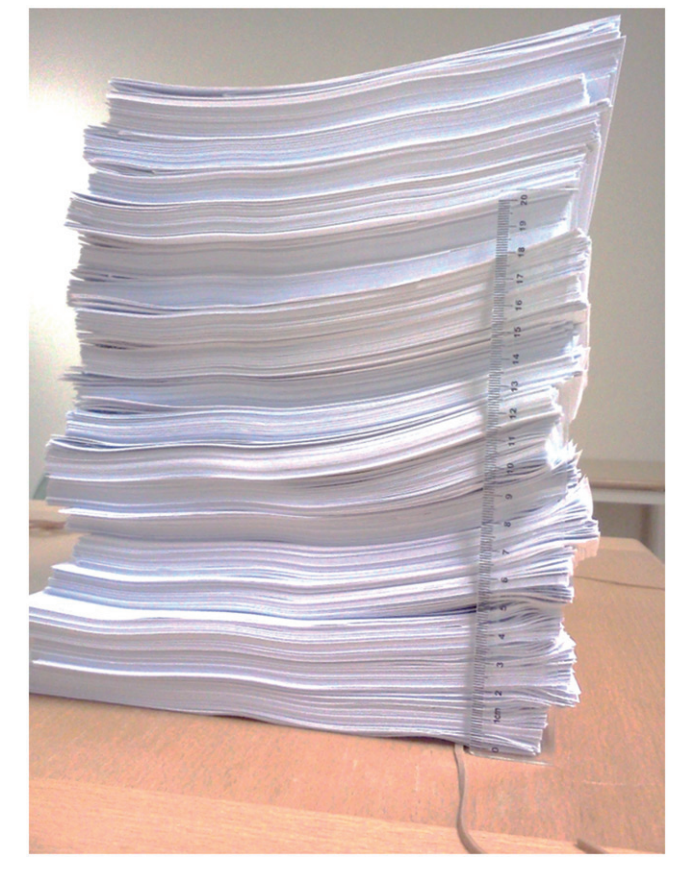
Figure 2. Resubmission to the ethics review board.

The primary application to the ethics review board was submitted when all cohorts were identified, and cohort holders had agreed to participate in the project. In the first round of comments, the ethics review board required details on inclusion criteria for all cohorts, descriptions of the data