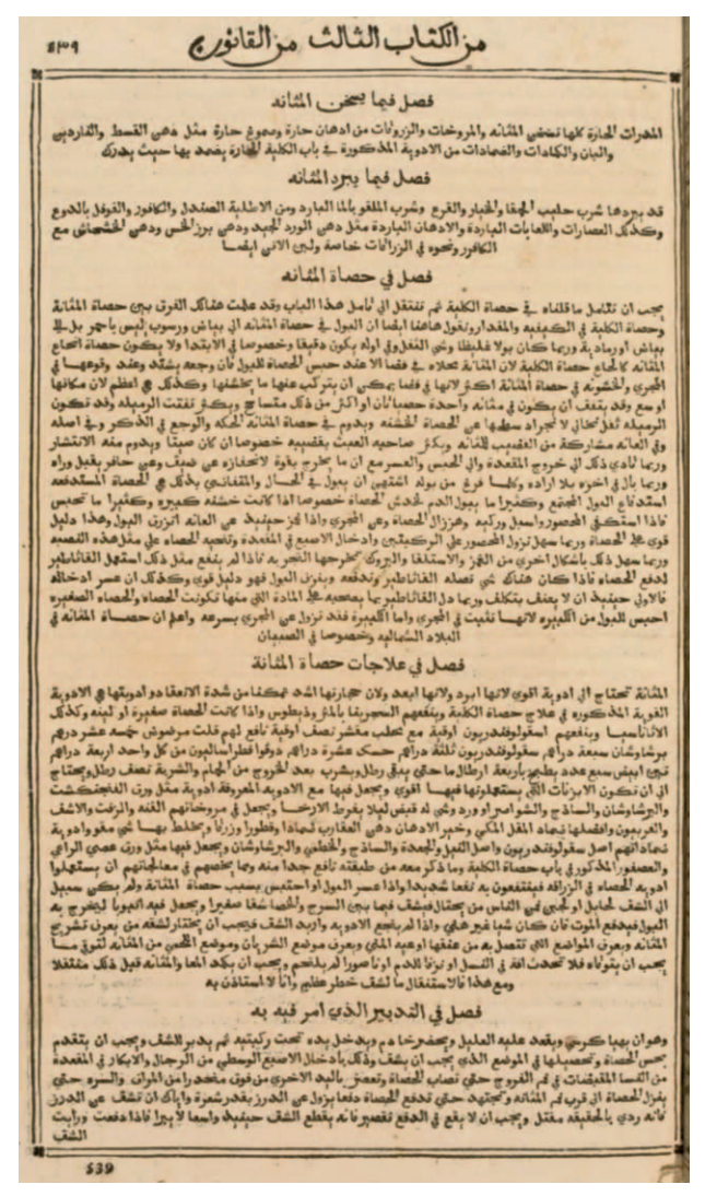
Figure 2. The third book (Part 19, Treatise 1, Chapter 6) of the Canon of Medicine in Arabic on surgical treatment of bladder calculi. Adapted from the web site of the Saab Medical Library of the American University of Beirut.

If urinary retention occurs in the presence of bladder calculus and it is not possible to incise