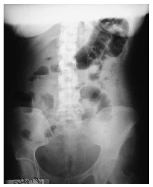
Figure 2. Plain Abdominal radiography shows multiple air fluid level patterns and empty pelvic cavity.