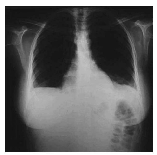
Figure 3. Chest x-ray reveals bilateral pleural effusion.