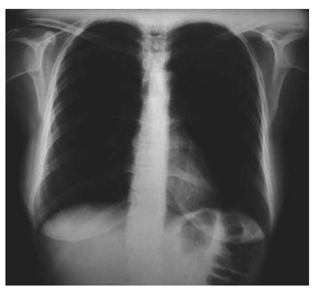
Figure 2. Normal chest x-ray after conservative treatment.