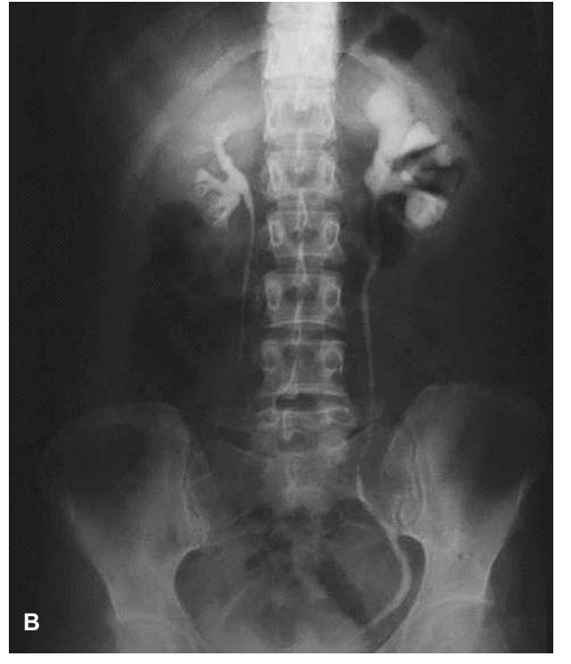
Figure 1. Intravenous urography demonstrates a 3-cm stone in the left kidney.