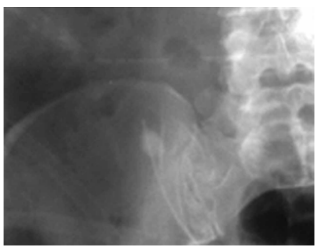
Figure 1. Plain film and retrograde pyelography show right pelvic kidney stone in one patient.

In addition to obvious obesity and short stature, one patient had history of previous open extraperitoneal pyelolithotomy of the affected kidney and another one had undergone