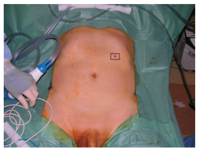
Figure 1. Palmer's point.

have been advocated. Palmer described the use of the left subcostal pararectus region as the primary puncture site, known as Palmer's point (Figure 1).<sup>(4)</sup> This technique has mainly been employed for procedures in the upper abdomen.