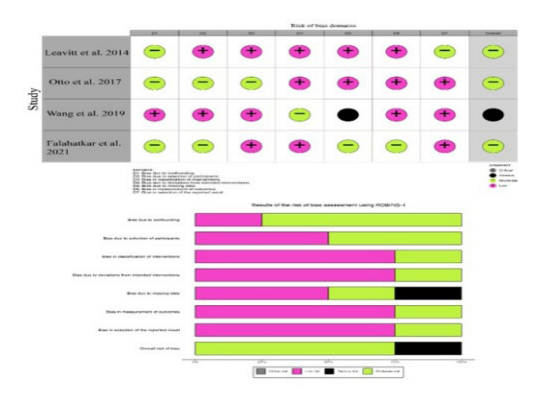
Figure 2. Results of the risk of bias assessment using ROBINS-I scale.

Moreover, we also appraised study quality by using the Cambridge Quality Checklists<sup>(15)</sup>, which could assess the quality of correlational evidence for risk and protective factors (on the basis of sampling, participation rates, sample size, and measurement reliability), temporal evidence (whether data are cross-sectional, retrospective, or prospective), and causal evidence (whether there is variation in the risk or protective factor, change in outcomes is analyzed, and confounding is accounted for).