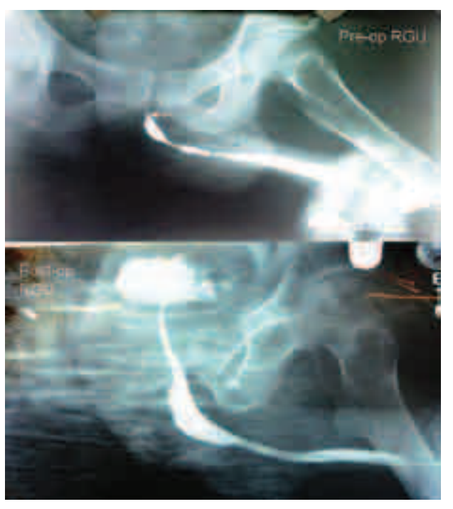
Figure 1. Pre-operation; Multiple Penile urethral strictures Postoperation; wide patent urethra after Tunica Albuginea Urethroplasty

Operative procedure involved TAU for anterior urethral strictures, in which edges of dorsal urethrotomy were sutured to the edges of the urethral groove.<sup>(3)</sup> Hence, roof of the neourethra was formed by the tunica albuginea of the corpora cavernosa. In cases where prostato-membranous urethral distraction defect was also present, the strictured membranous urethra was completely excised and prostatic urethra was anastomosed to