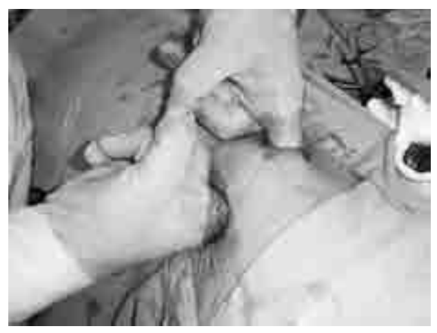
Figure 1. Operative image of the bilateral finger assisted laparoscopic renal cyst excision.

Following CO2 insufflation, a 10-mm trocar was inserted in the first incision and 30° telescope was placed through this trocar. The other trocars