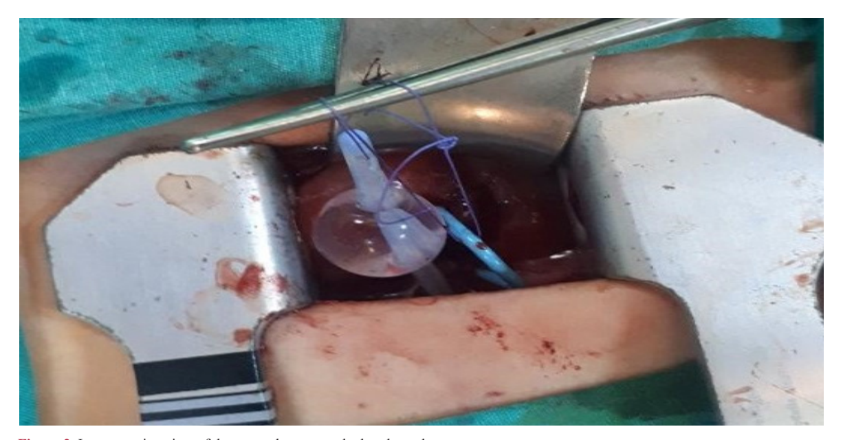
Figure 2. Intraoperative view of the ureteral stent attached to the catheter.

A total of 16 girls and 9 boys were included in the study. The mean age was 4.3 and 6.3 years in groups 1 and 2, respectively. The mean follow-up period for Group 1 was 10.1 months (range 3–18 months), while in Group 2 it was 9.8 months (range 3–18 months). Two of the patients in Group 2 had cystitis-like symptoms, and no evidence of urinary tract infection was detected. Complaints were due to DJS irritation, and anticholinergic treatment was started. Both patients experienced regression of these complaints, and treatment continued until the stents were removed. None of the patients had postoperative pyelonephritis. Although the stents of patients in Group 1 were withdrawn early, no progress was observed in any of the patients' hydronephrosis,