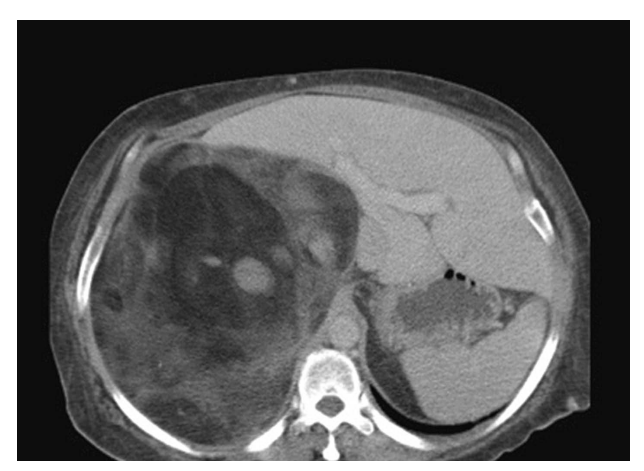
Figure 1. Liver hilum stretched by the huge retroperitoneal tumor.

a reverse L incision. A huge heterogeneous retroperitoneal tumor was found in the right upper quadrant of his abdomen. The liver was pushed anteriorly with the gallbladder and hilum stretched over the mass. The inferior vena cava and the right renal vein were grossly stretched and compressed by the mass. There was no bowel involvement. The right kidney was freed from the tumor down to the renal capsule. The tumor was then excised preserving all the other structures. A small nodule was seen superficially in the right lobe of the liver and a nonanatomical wedge resection using the TissueLink DS3. 5C radiofrequency dissector was performed. The umbilical hernial defect was repaired with PROCEED intraperitoneal mesh, stapled in situ. The procedure took approximately 4 hours and was associated with no transfusion requirement. Postoperatively, the patient was extubated immediately and made an uneventful recovery. He was discharged on the 10th postoperative day.