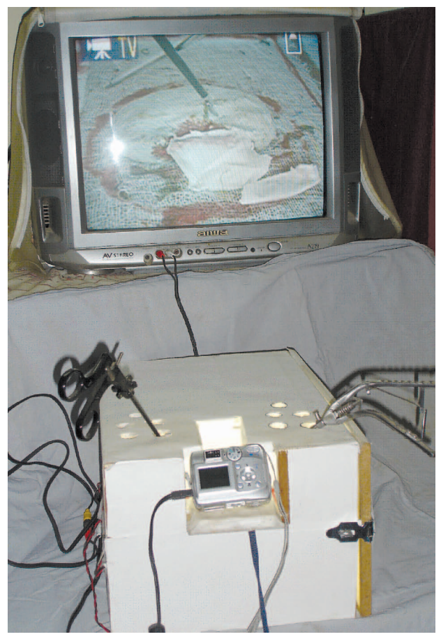
Figure 3. Laparoscopy trainer coupled with a TV monitor.

one hand instrument to other holding sutures, passing needle through soft objects, applying square knot, doing blunt dissection, etc, were performed. Artificial kidney, pelvis, and ureter could be kept inside the box, and laparoscopic pyeloplasty and nephrectomy could be practiced (Figure 2). One could also zoom in and out the point of interest for which no assistant was required.