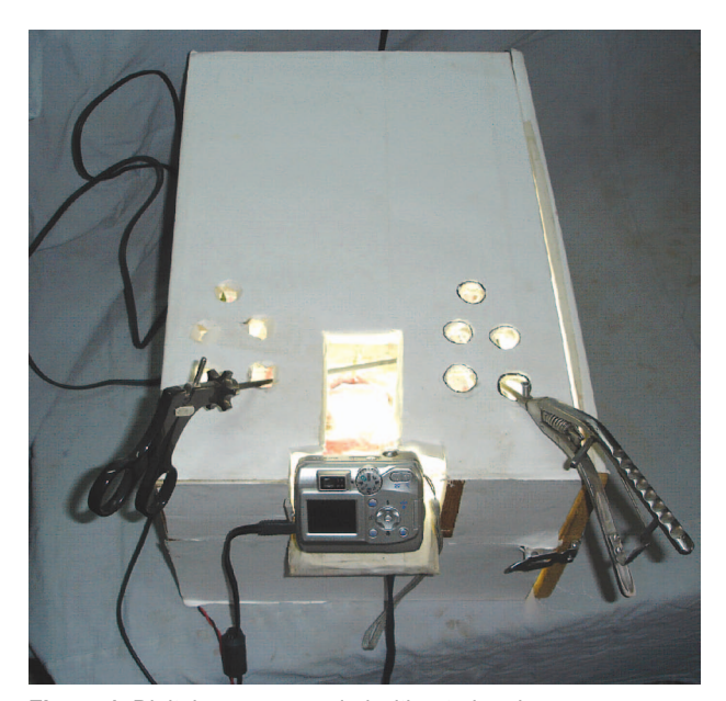
Figure 1. Digital camera coupled with a trainer box.

We used a digital camera (Nikon Coolpix 3200, Tokyo, Japan) which has digital and optical zoom and continuous autofocusing facility and TV monitor display (Figure 3). The camera uses rechargeable nickel cadmium a-a size batteries which usually last an hour. Using this trainer with TV monitor, basic laparoscopic skills like holding suture needle while lying free on the internal organ surface, transferring needle from